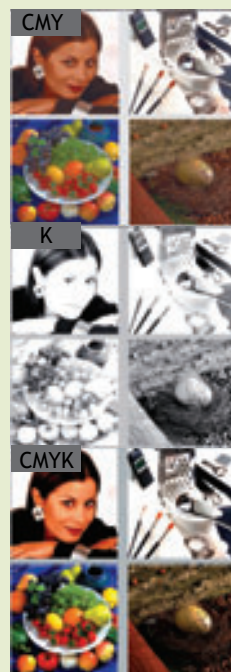
Before OnColor Eco